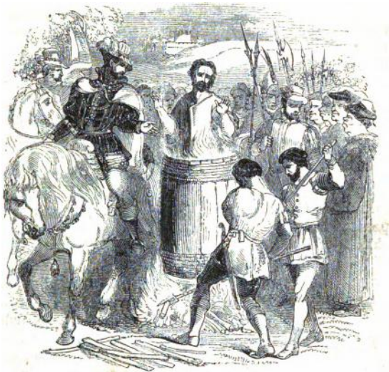
MARTYRDOM OF JOHN BADBY, A.D. 1409. (SEE PAGE 15.)