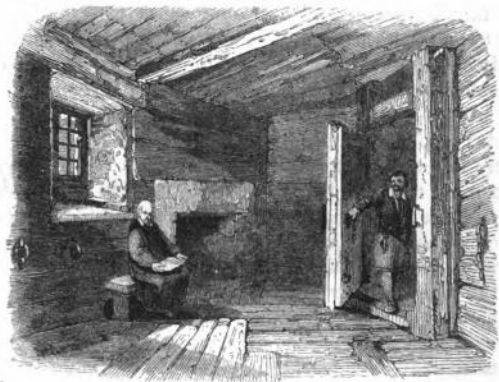
INTERIOR OF LOLLARDS' TOWER

The reader will have noticed, that Lambert was thus cruelly imprisoned in the Lollards' tower, and at length burned, because he refused to believe the doctrine of transubstantiation ; we may say, on that ground only, for no other accusation appears to have been alleged against him at his public trial, if it may be so called.