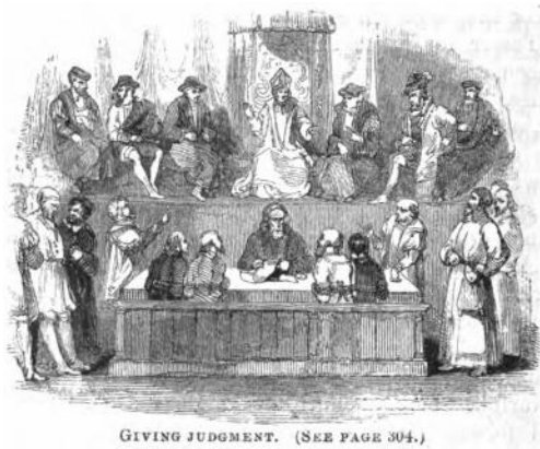
GIVING JUDGMENT. (SEE PAGE 304.)